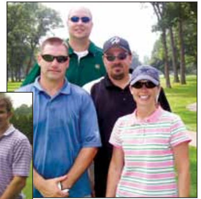
Teachers Credit Union Team