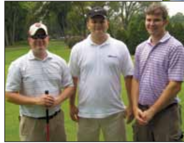
AM General Team